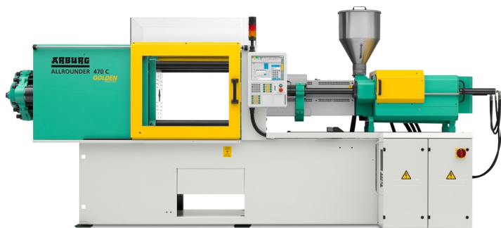
Proto Labs UK is buying six more ARBURG Golden Edition and ‘S’ machines. Pictured is a 470 C 1500 400, 150 tonne Golden Edition

Liquid silicone rubber products have been growing strongly within the Proto Labs portfolio.“ Customers with LSR designs that are perceived as difficult to engineer are surprised at how quickly we return the product, and with high accuracy,” said Lee.